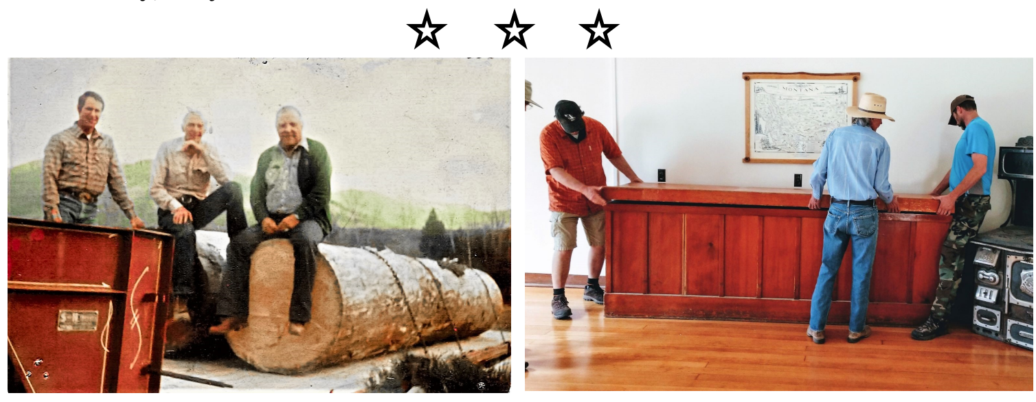
The Nine Mile House bar, from a 1983 Western Larch to a 2020 permanent addition to the Community Center. (and quite a few drinks in between)